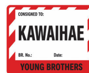
PORT OF DESTINATION LABEL

Ensure all temperature-sensitive cargo is clearly marked with the appropriate "Freeze" or "Chill" label.