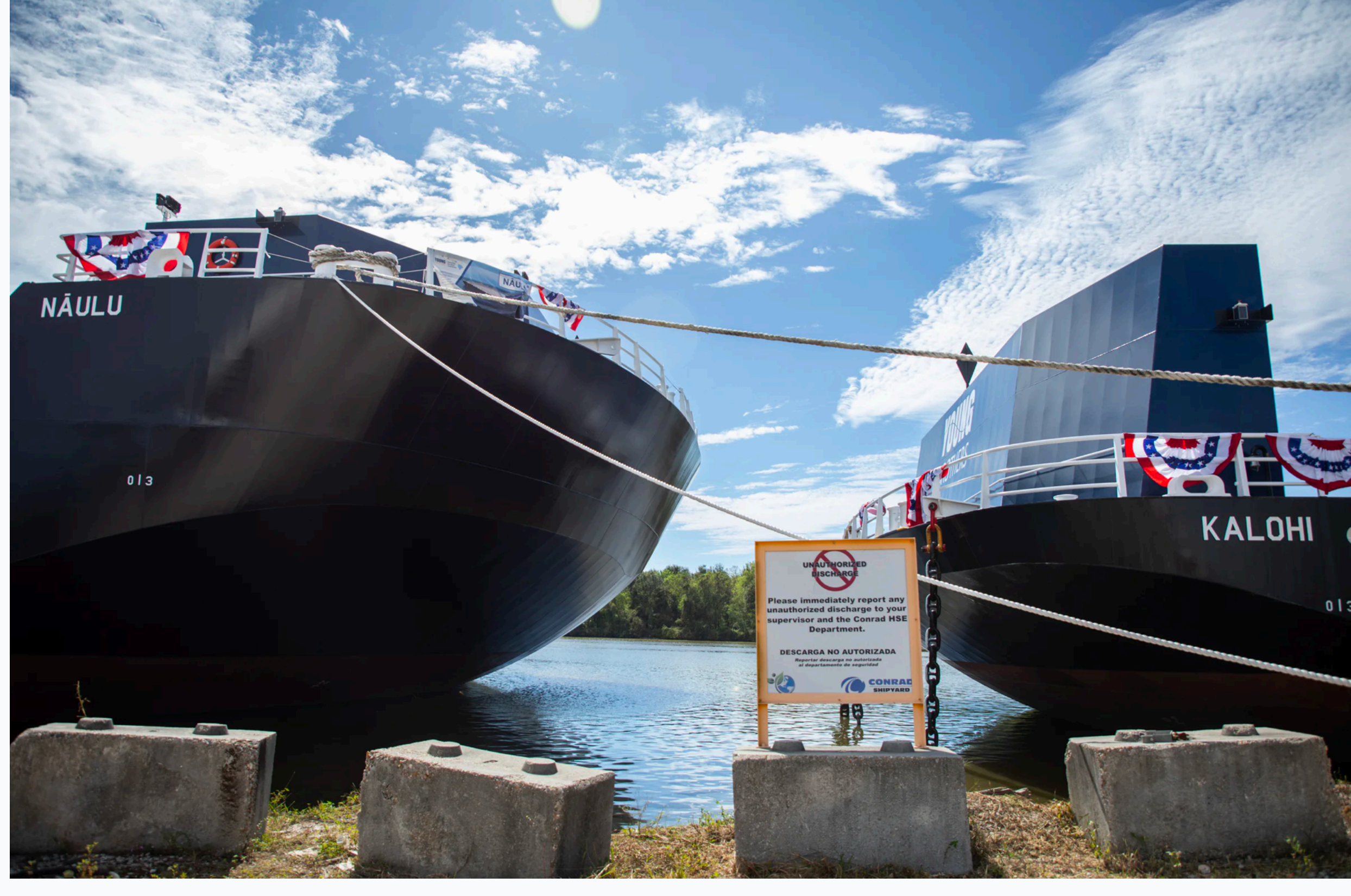
Nāulu , named for a sea breeze and rain in Kawaihae, Hawaiʻi. Literally translated, Nāulu is a sudden rain shower that quickly passes.