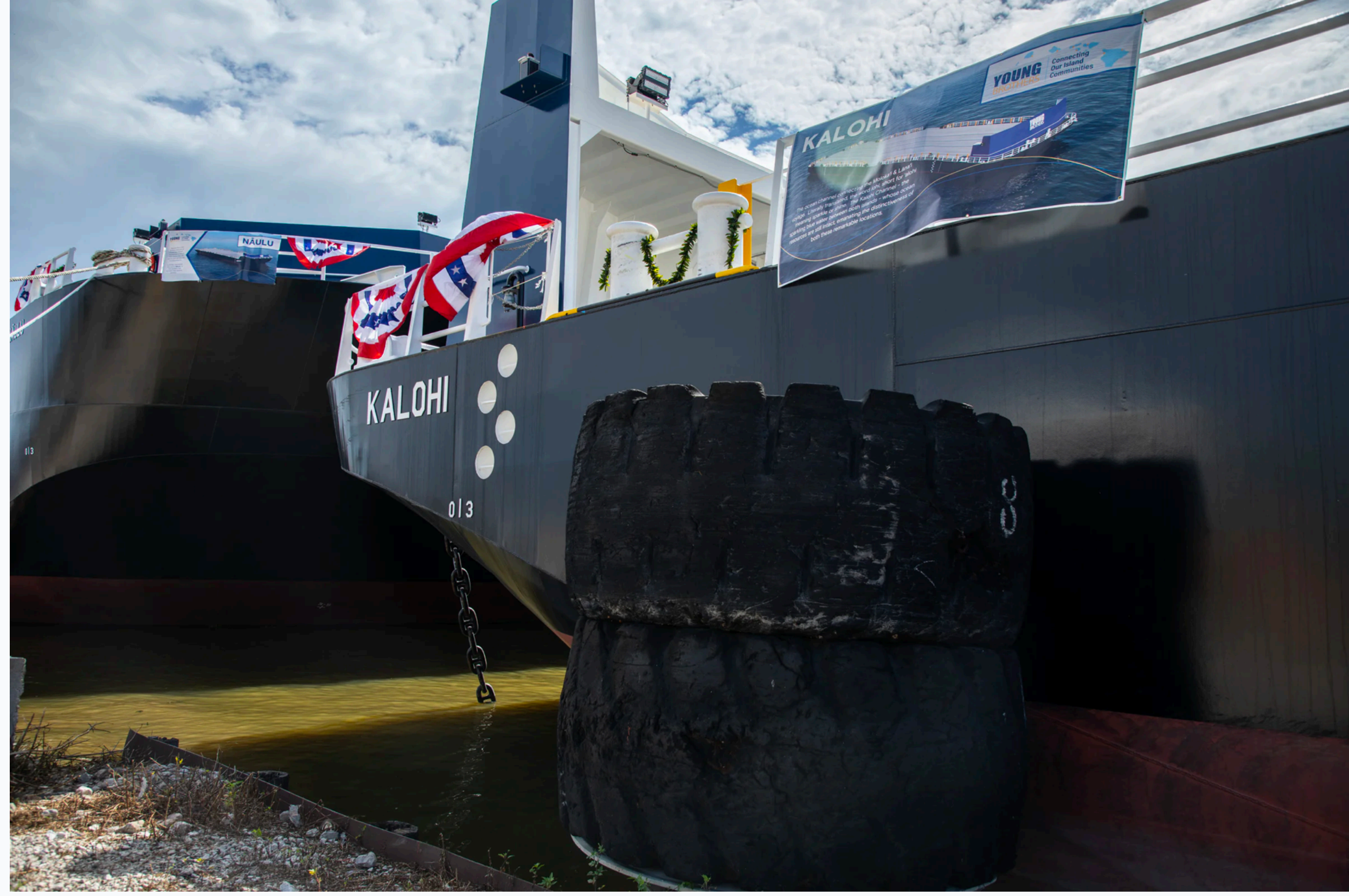
The name Kalohi , inspired by the channel that links Lānaʻi and Molokaʻi, comes from "lohi," which is short for "alohi," meaning sparkle or shine.