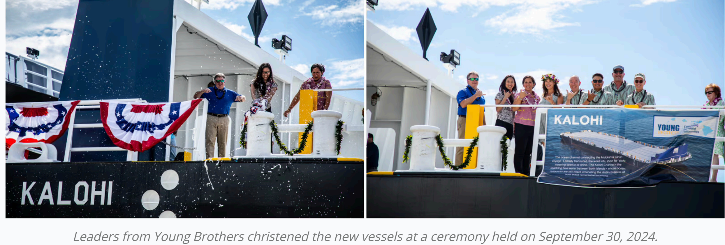
Leaders from Young Brothers christened the new vessels at a ceremony held on September 30, 2024.

MORGAN CITY, LA – Last week, Young Brothers christened the Kalohi and Nāulu barges , marking a milestone in the more than $45 million investment to enhance the reliability and resilience of the interisland shipping services. Entering service in December 2024, the new barges will provide additional cargo capacity and were designed with advanced technology and features that make it safer and more efficient to load and unload cargo.