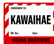
PORT OF DESTINATION LABEL

Ensure all temperature-sensitive cargo is clearly marked with the appropriate "Freeze" or "Chill" label.